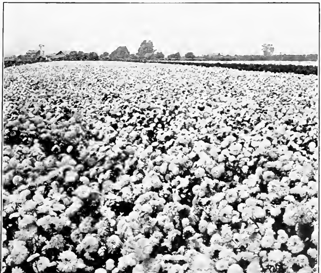
FIELD VIEW OF ASTERS—CALIFORNIA GIANT